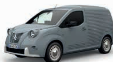
THASOS BLUE AC 131 - Pastel