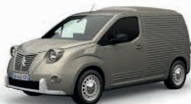
IRISÉ GREY AC 109 - Metallic