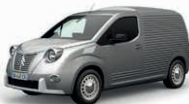
ARTENSE GREY - Metallic