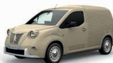
NEVADA BEIGE AC 074 - Pastel