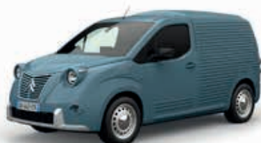
WEEK-END BLUE AC 625 - Pastel