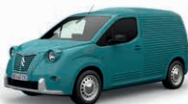
LAGUNE BLUE AC 639 - Pastel