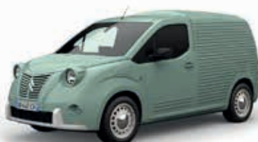
JADE GREEN AC 539 - Pastel