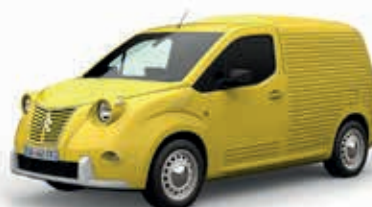
ATACAMA YELLOW AC 363 - Pastel