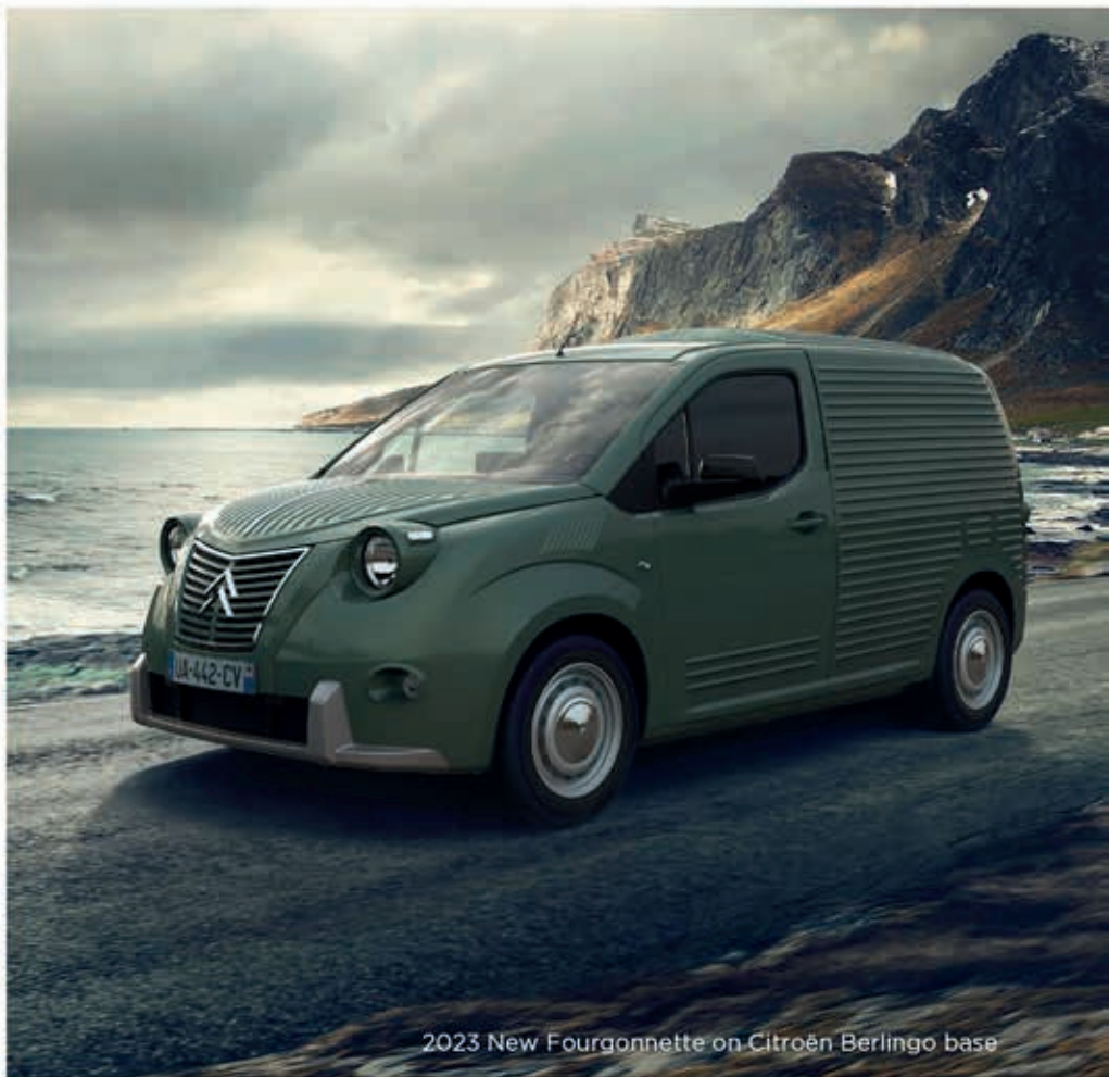
2023 New Fourgonnette on Citroën Berlingo base