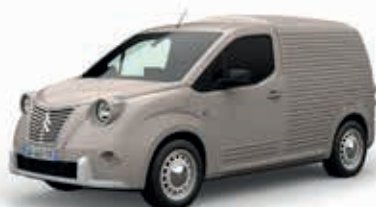
ROSÉ GREY AC 136 - Pastel