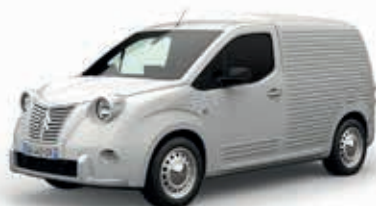
WHITE - Pastel