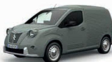
CONCRETE GREY RAL 7033 - Pastel

Our Fourgonnette color palette consists of 2 Berlingo paint finishes and 10 historic Citroën colors from the 60s and 70s. In addition to these options, you can also choose our special 'Concrete Grey' tone, as well as a 100% custom paint, or you can order the Fourgonnette with your company's livery.