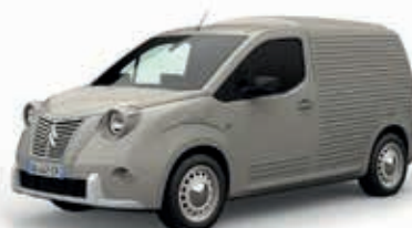
MATINAL GREY AC 081 - Pastel