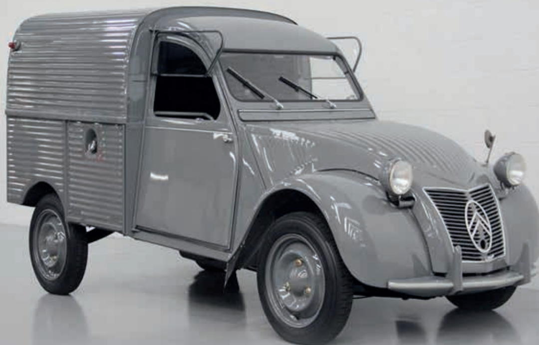
1951 Citroën 2CV 250AU First series

The New Fourgonnette is a modern "lifestyle" representation, drawing inspiration from the legendary 2CV AU launched in 1951, which - together with its descendant, the 2CV AZU launched in 1954 - proved hugely successful in its time with nearly 1,247,000 units sold.