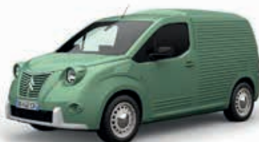
PAPYRUS GREEN AC 536 - Metallic