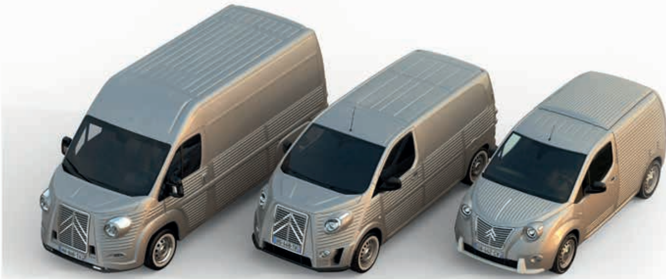
Type H, Type HG and the New Fourgonnette